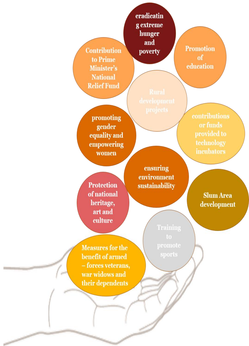
Activities as per Schedule VII of Sec. 135 of the Companies Act (2013)

This, in fact, demands the alignment of CSR with business strategy to create a business that is sustainable in the truest sense. It is also important that the joint efforts be made to directly influence the public to achieve the fruits of overall social development.